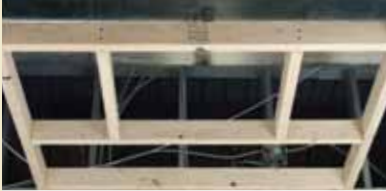
1. Frame the opening.