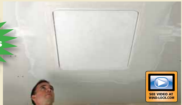
4. Tape and apply drywall compound.