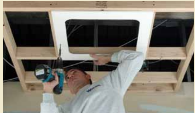
2. Mount Stealth surround with drywall screws.