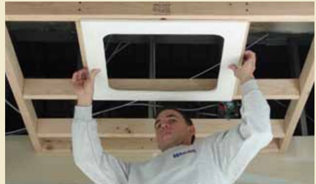
1. Frame the opening.