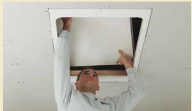
3. Install drywall and place access panel in opening.